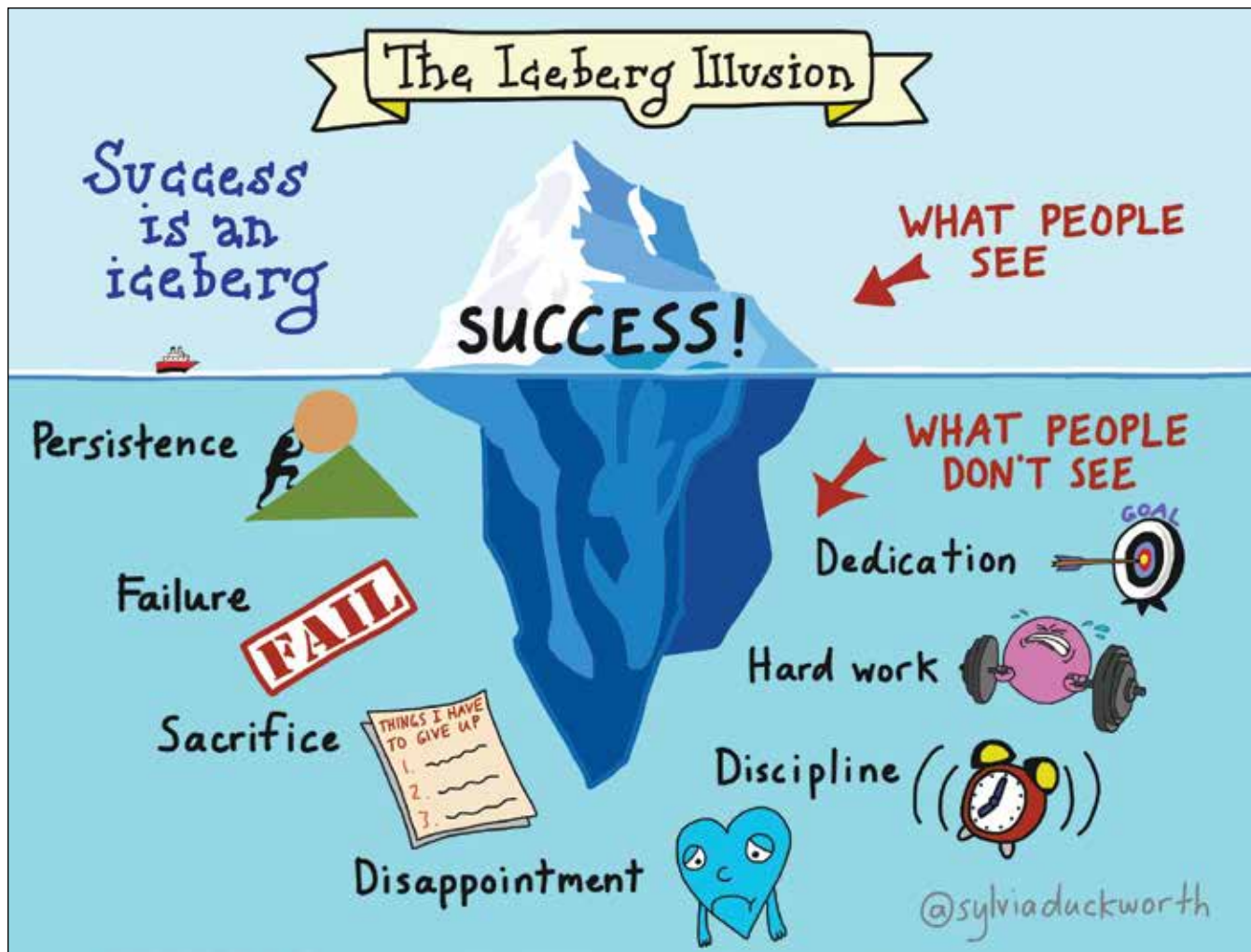
The Iceberg Illusion was created by Sylvia Duckworth

“The Iceberg Illusion” below may best explain what one can expect: