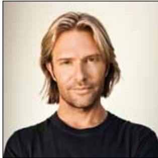
Eric Whitacre, 2016 TBA Featured Composer